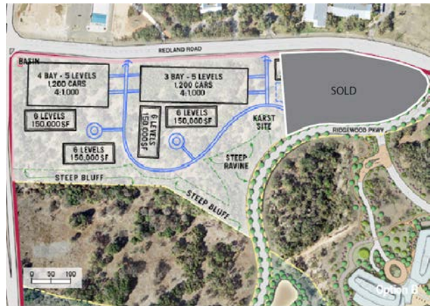
HYPOTHETICAL PLANS OF DEVELOPMENT